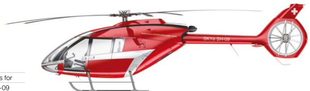
Complex, highly-sophisticated parts for Marengo Swisshelicopter SKYe SH-09